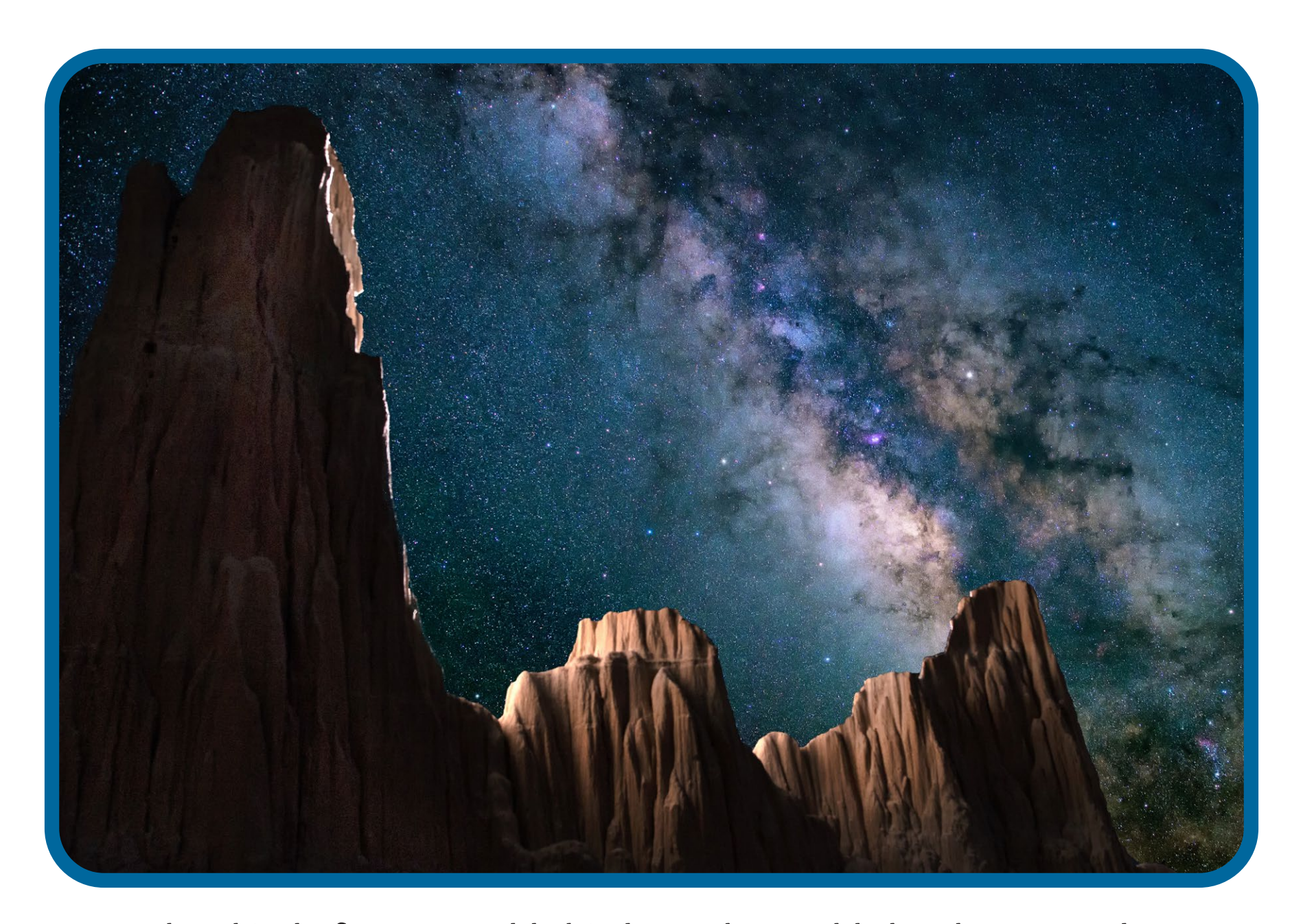
What kind of story could this be? Who could the characters be? When could this story be set? What could a possible problem be?